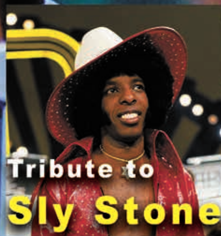
Tribute to Sly Stone

NEW LONDON COUNTY - MYSTIC - WESTERLY - RHODE ISLAND